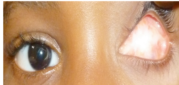
Figure 1a. Growth of secondary dermis-fat Graft - 3 years post-operatively.

There was increase in volume of DFG in 14 (93.3%) patients (Figure 1a). Good prosthetic fitting with good facial symmetry were achieved in the 14(93.3%) children who showed growth in the DFG.(Figure 1b).