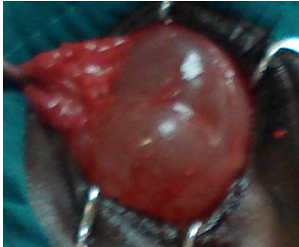
Figure 2 Macrocyst in dermis fat graft seen 5 months post-operatively.

The patient with infection and necrosis demonstrated no increase in volume of DFG and was lost to FUP after 13 weeks.